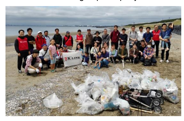
Kawasaki Kisen Kaisha, Ltd. (Tokyo, Japan)