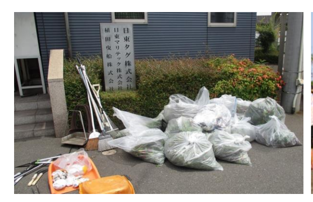
Nitto Tugboat Co., Ltd. (Okayama, Japan)