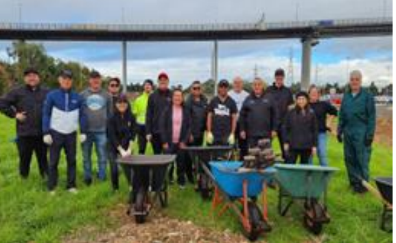
"K" Line (Australia) Pty Limited (Australia)

(*) World Oceans Day was officially designated by the United Nations in 2009 to raise global awareness of the benefits humankind derives from the ocean and our individual and collective duty to use its resources sustainably. On that day, awareness-raising events such as ocean cleanup are held over 100 countries every year.