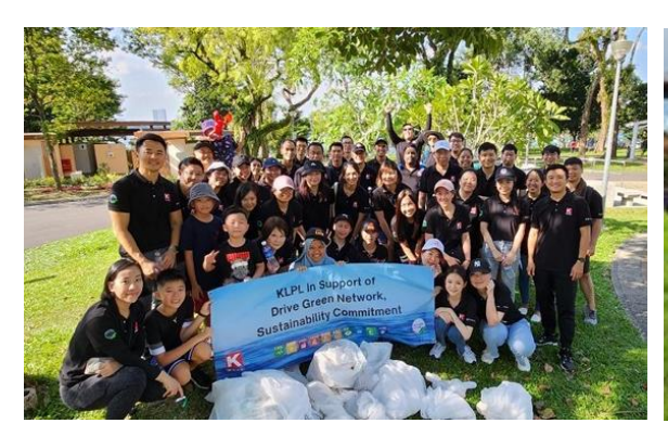
"K" Line Pte Ltd. (Singapore)