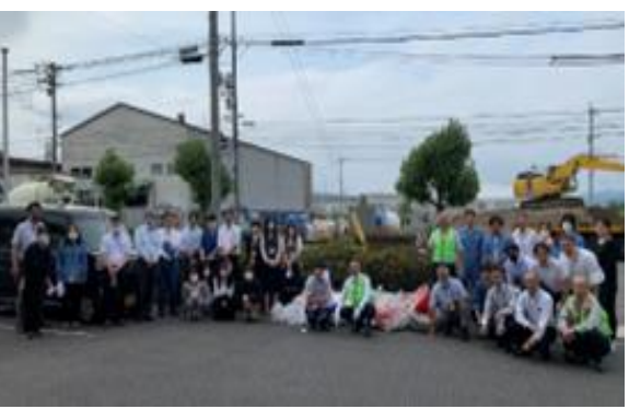
Seagate Corporation (Hiroshima, Japan)