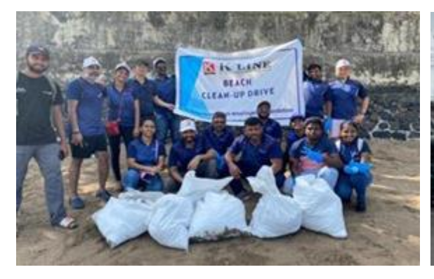
"K" Line (India) Private Limited (India)