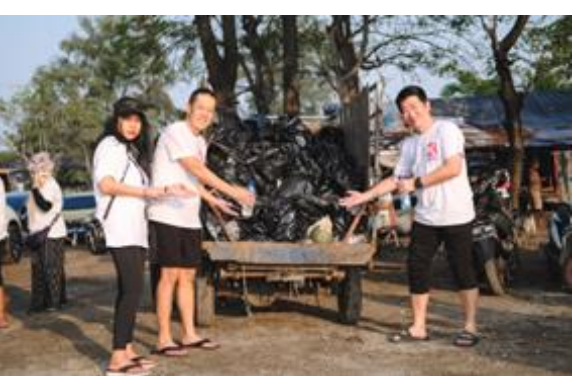
PT. K Line Indonesia (Indonesia)