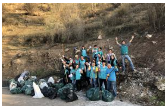
"K" Line Chile Ltda (Chile)