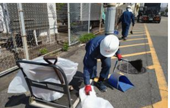
Daito Corporation (Tokyo, Japan)