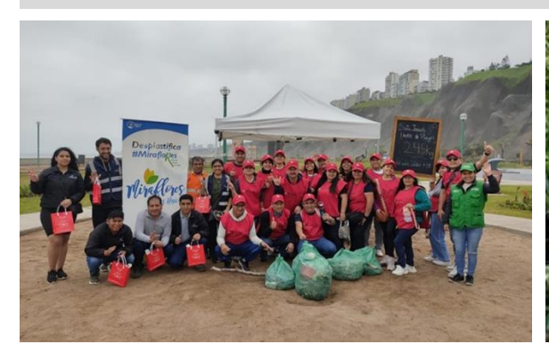
"K"Line Peru S.A.C. (Peru)