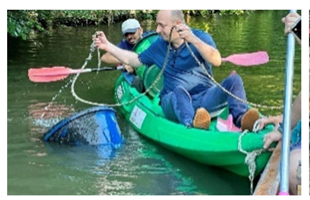
"K" Line (Deutschland) GmbH (Germany)